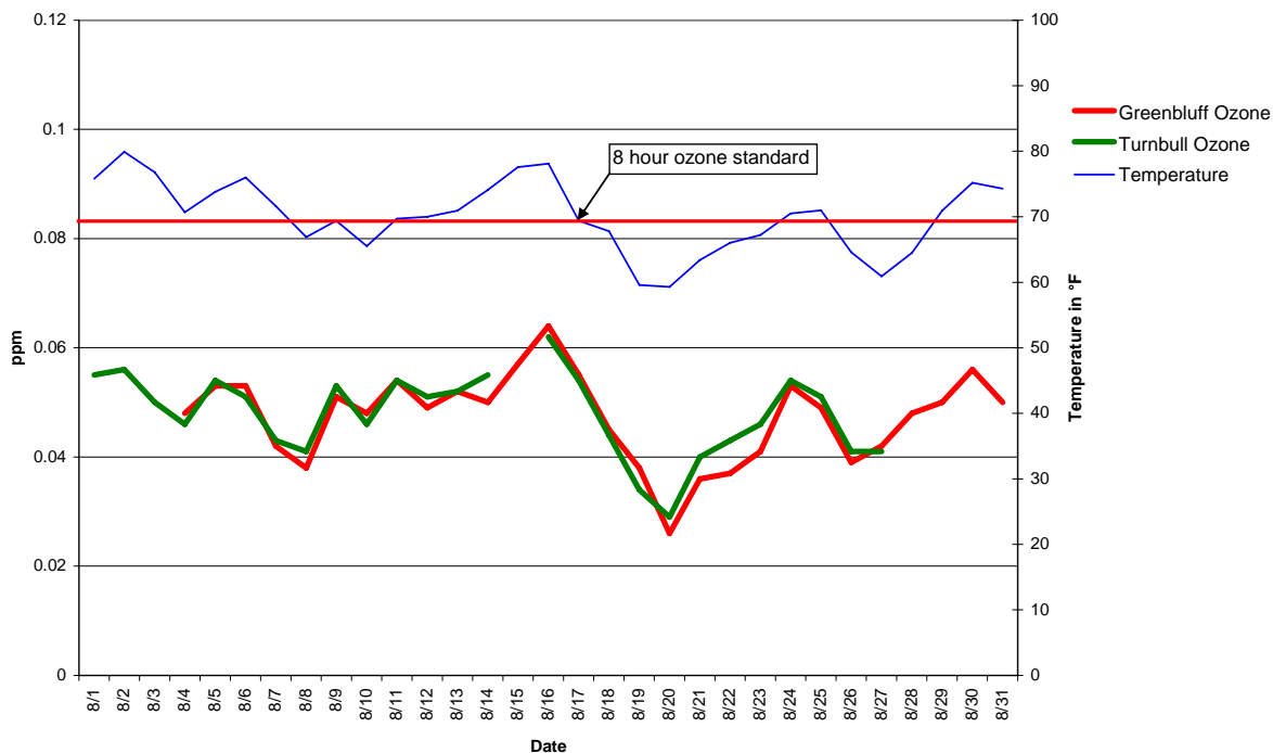
Eight Hour Maximum Ozone Concentrations for Spokane Greenbluff & Turnbull Sites (with daily maximum temperature)

The chart below shows the ozone data for August measured at Greenbluff in the foothills of Mt. Spokane and Turnbull Wildlife Refuge southwest of the metropolitan area. The ozone data are plotted with the daily maximum temperature data from the Freya & Ferry site. Temperature is a good surrogate for sunlight in the photochemical reaction that forms ozone. Ozone is monitored May 1 through September 30.